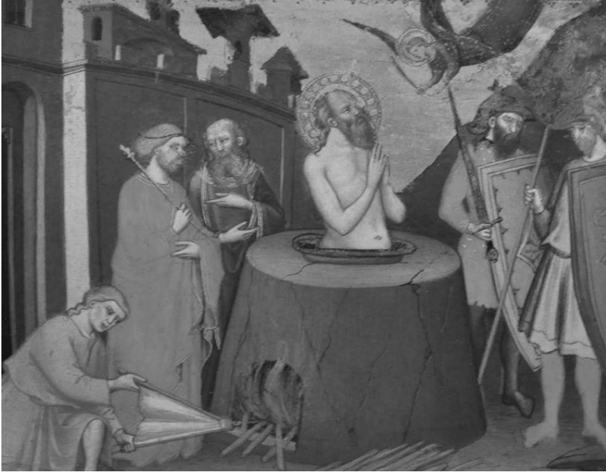
Ambrogio di Baldese c. 1395